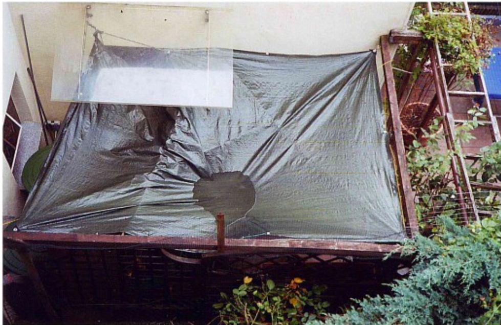
Fig. 2: Recent model for getting raining water in the city of Bremen with a plastic cistern.